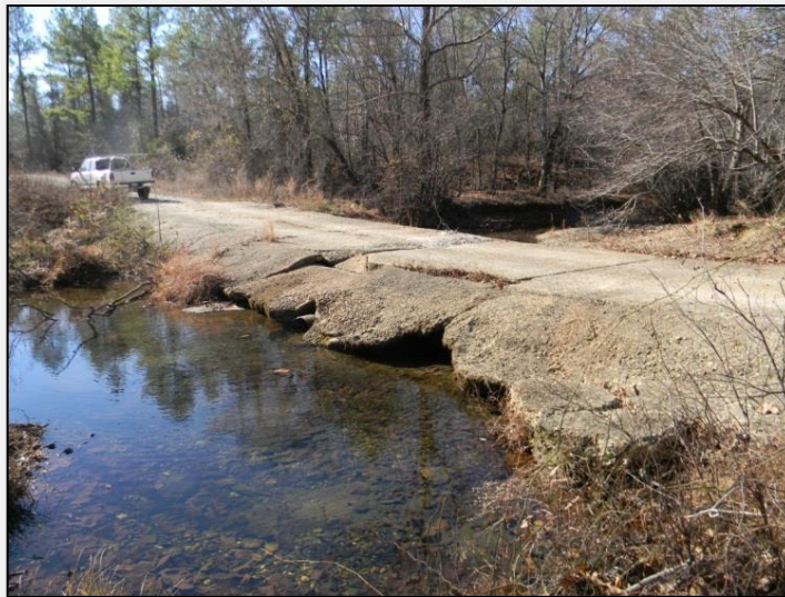
Cover Photo: Current low water crossing